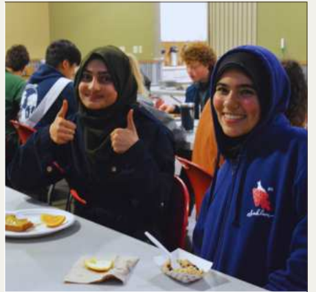
JUST HERE FOR THE FOOD LOWKEY