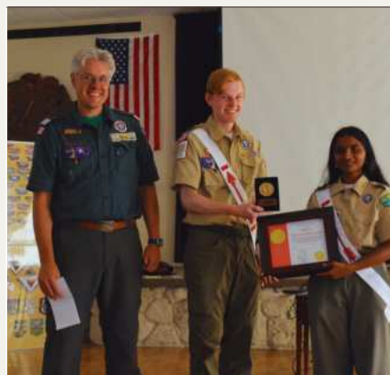
BIG THANKS TO OUR PREVIOUS LEADERS!