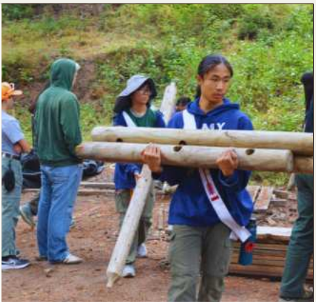
TEAMWORK MAKES THE DREAMWORK