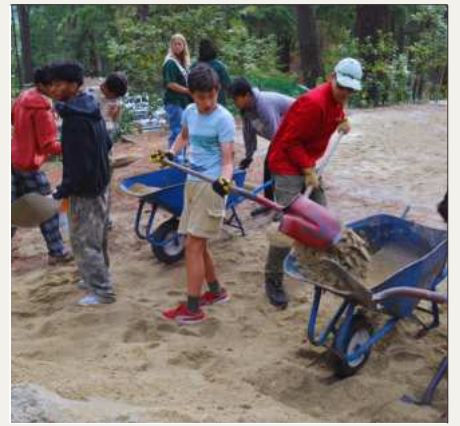
THIS TOOK SO LONG ITS NOT EVEN FUNNY