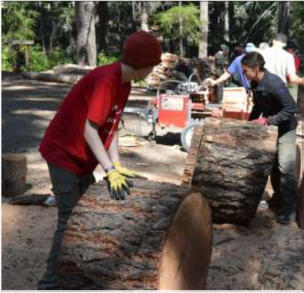
HAULING HEAVY WOOD