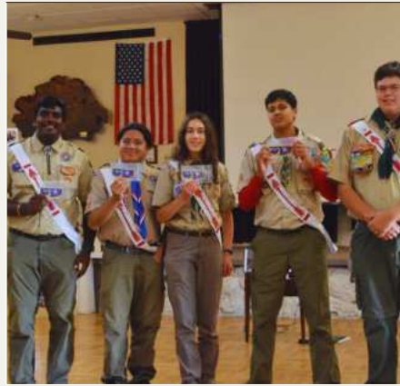
PLEASE ATTEND CHAPTER MTGS GUYS