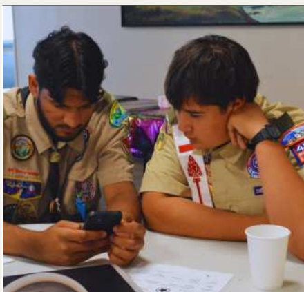
"BRO I NEED HELP WRITING MY SPEECH"