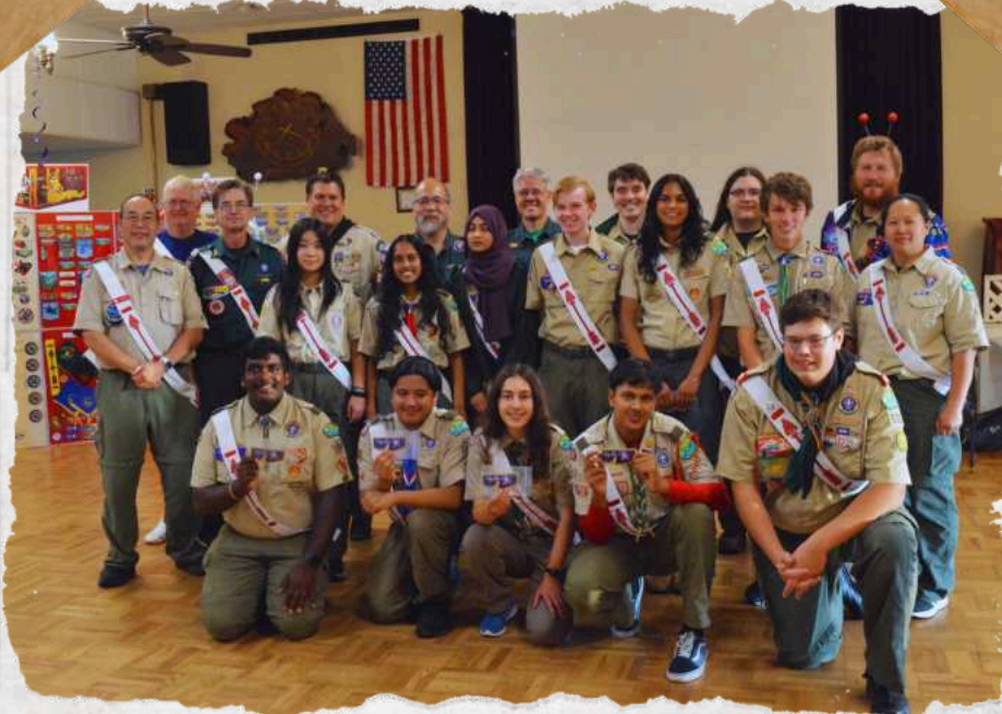
of our writer and joint bookman