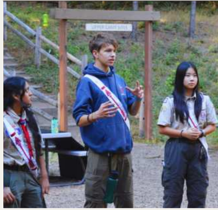
THE BIG BOSSES IN ACTION