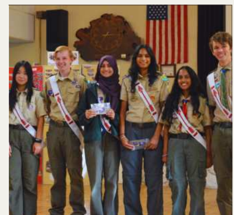
OUR NEWLY ELECTED LEC