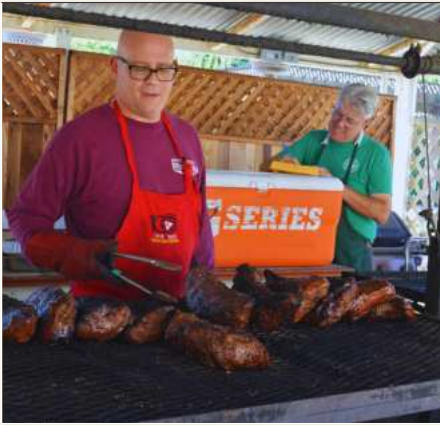
OUR AMAZING CHEF HARD AT WORK